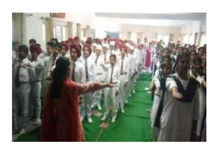
among the students. This was

The school organized a special assembly for classes V and VIII focusing on inculcation of reading habit followed