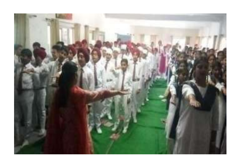
amongthestudents. This was

The school organized a special assemblyforclasses Vand VIII focusing on inculcation of reading habit followed