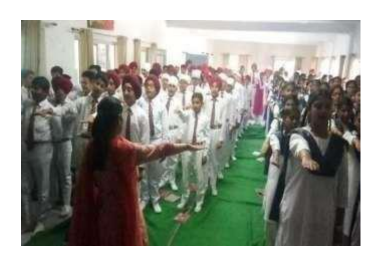
among the students. This was

The school organized a special assemblyforclassesVandVIII focusingoninculcationofreadinghabit followed